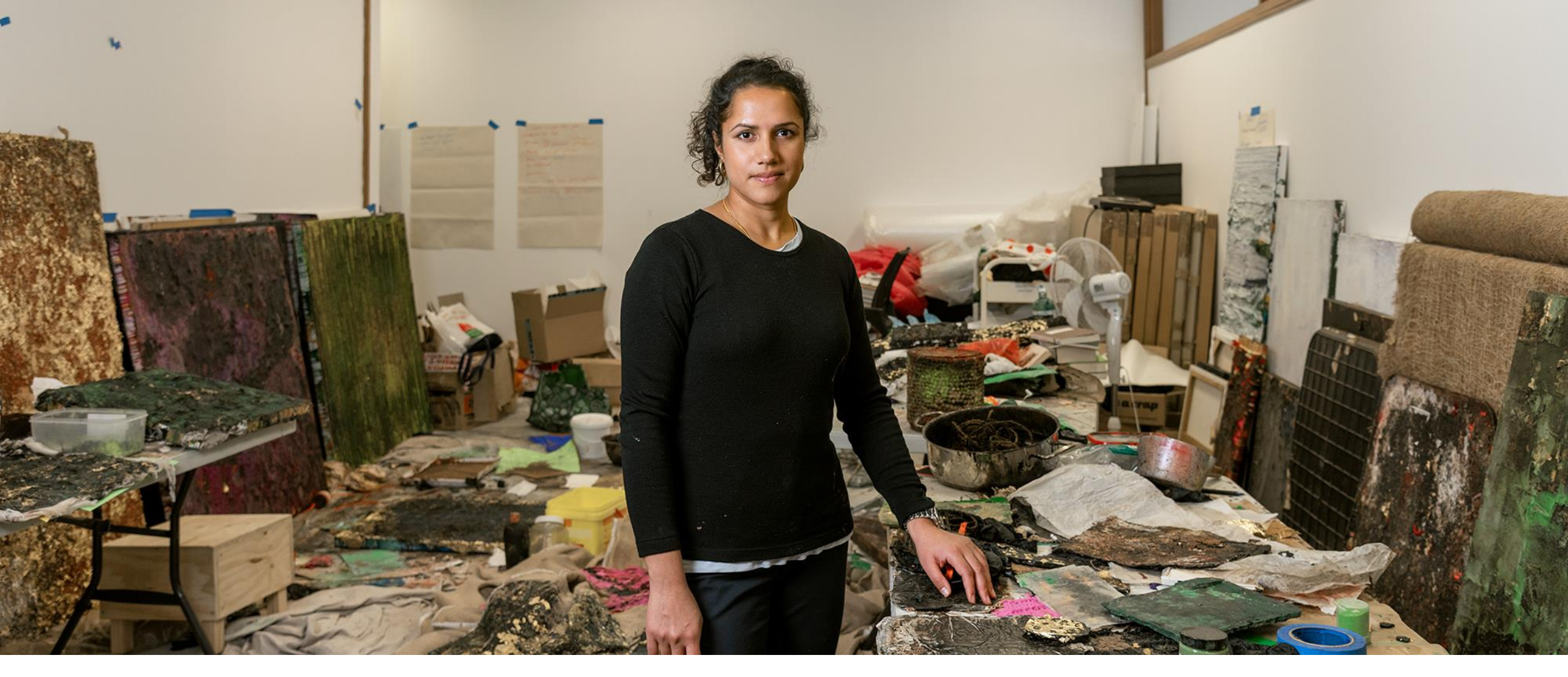
Artwork Name/Title, Year Produced, materials/dimensions. Exhibition/Presentation/Publication details

For audio/visual works, you may choose to include a still here from the work (if it is video), and the URL link to view the work. Remember to include a password if applicable.