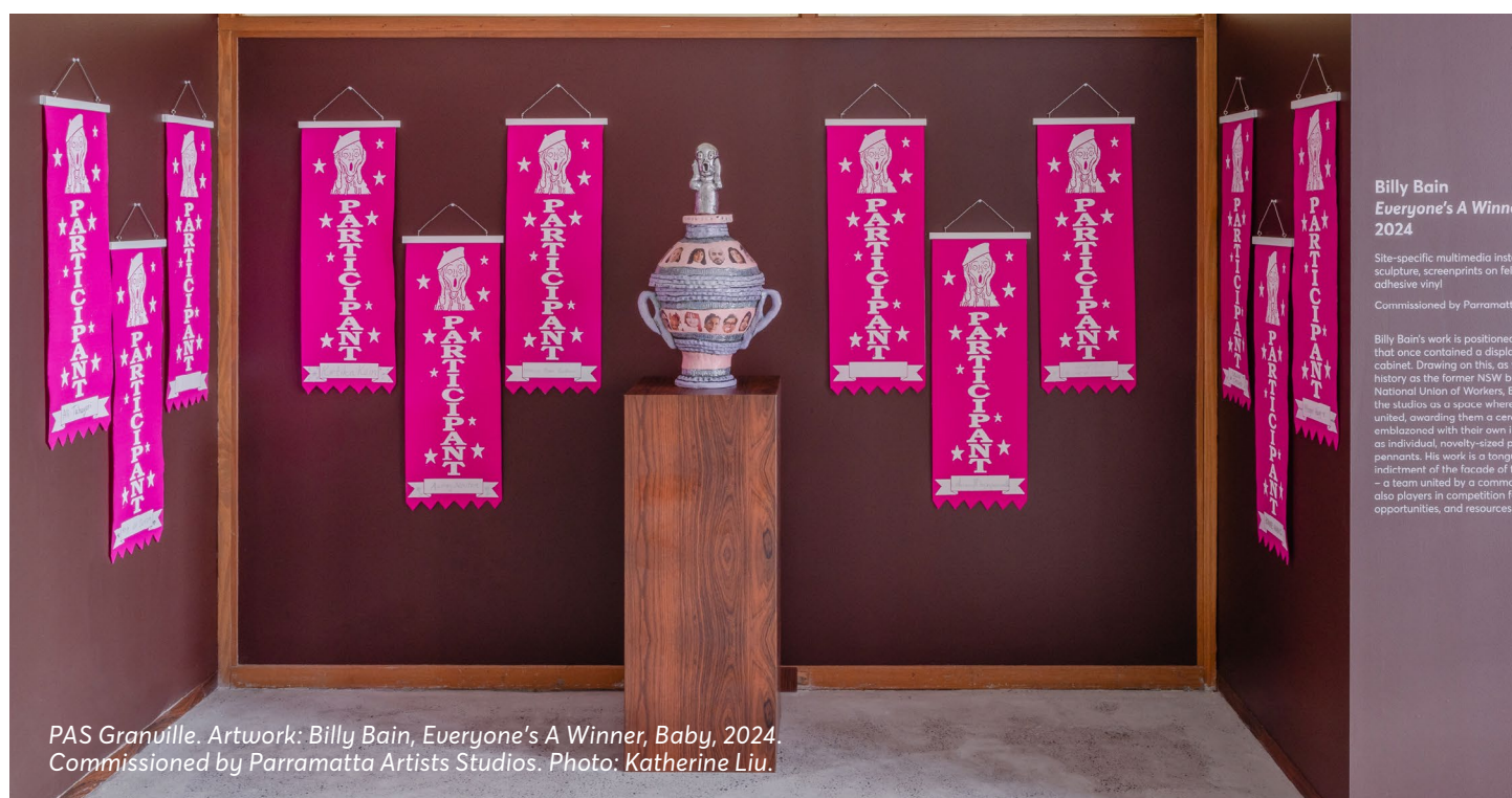
PAS Granville. Artwork: Billy Bain, Everyone's A Winner, Baby , 2024. Commissioned by Parramatta Artists Studios.

Once the Studio Artists are selected, the allocation of specific studios is determined by the Parramatta Artists Studios team.