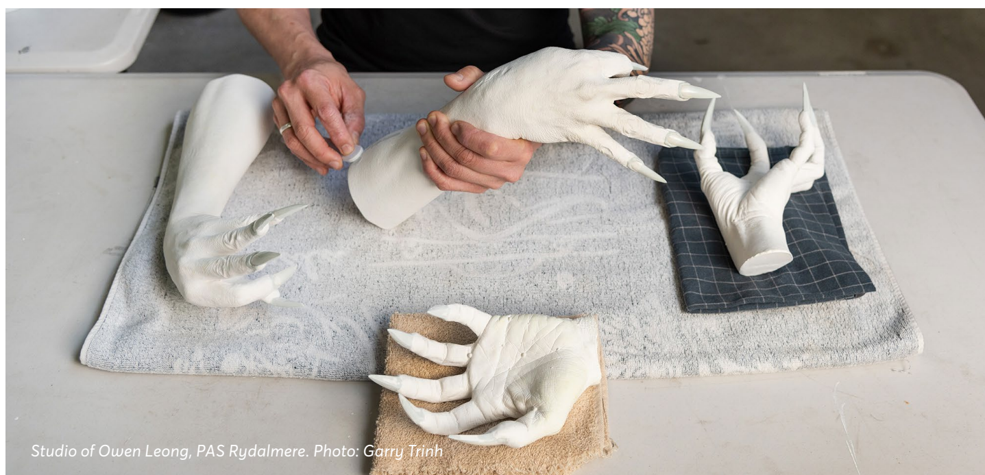
Studio of Owen Leong, PAS Rydalmere.