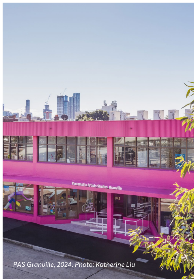
PAS Granville, 2024.

Two studios are located on the Ground Level; nine studios are located on Level 1.