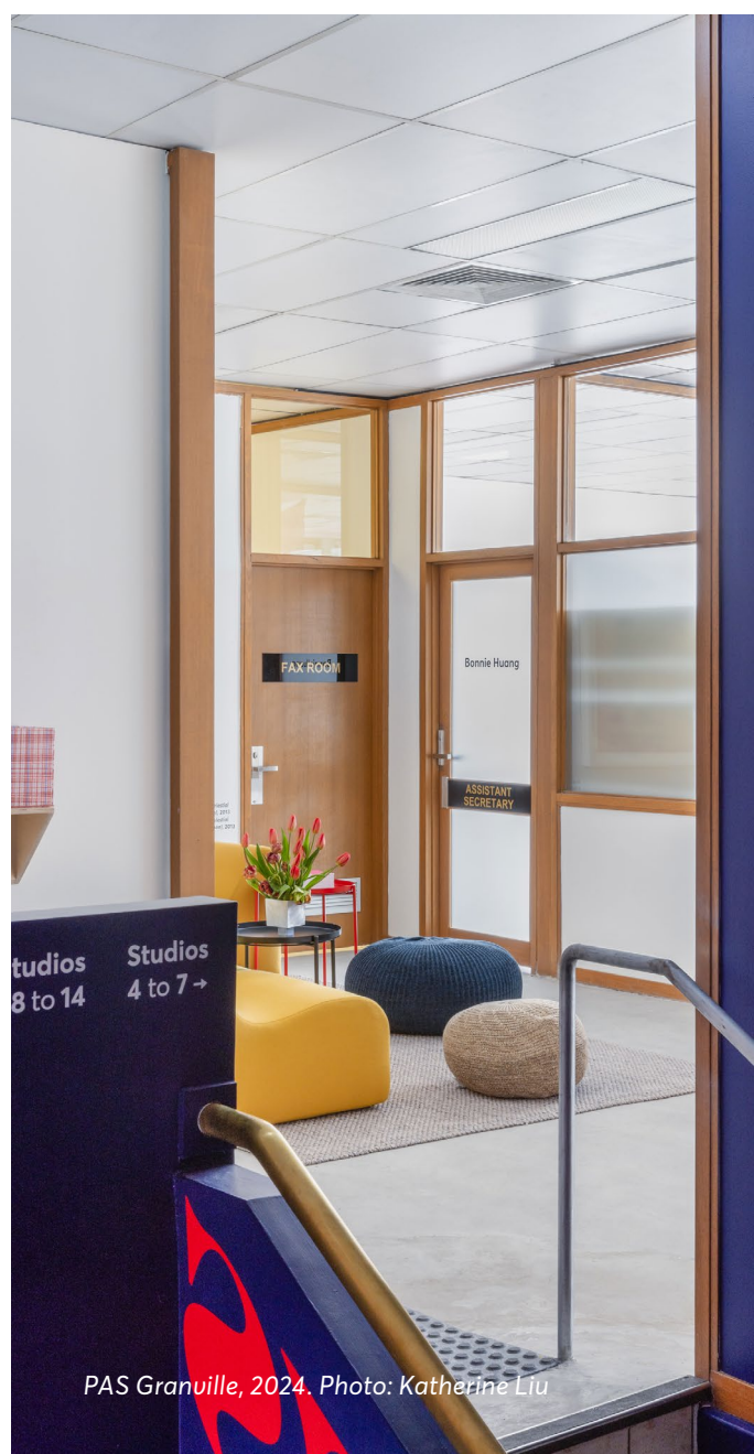
PAS Granville, 2024.