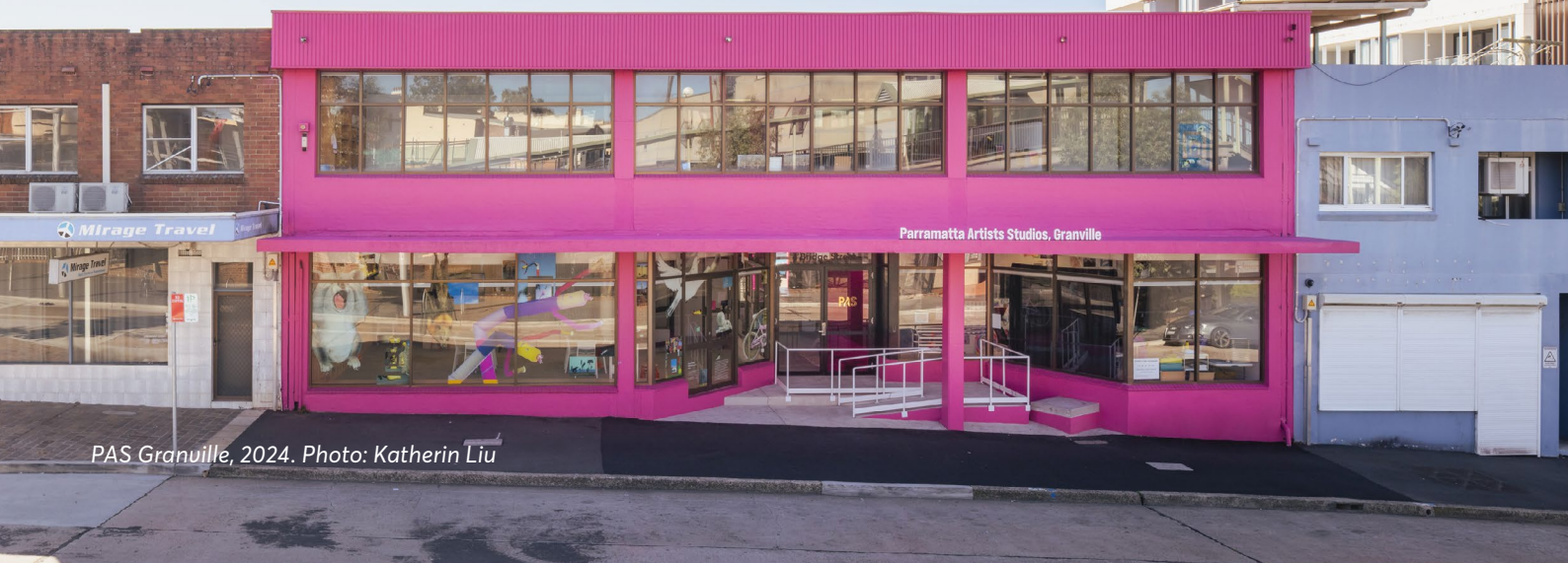
PAS Granville, 2024.