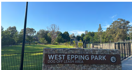
West Epping Park