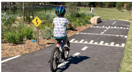
George Kendall Riverside Park, Ermington