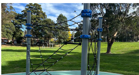
Homelands Reserve, Telopea