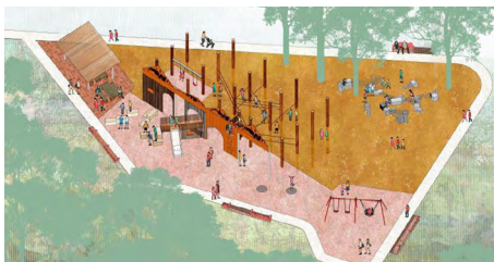
Shannons Paddock, Westmead.