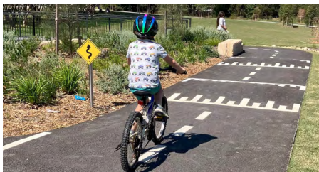
George Kendall Riverside Park, Ermington