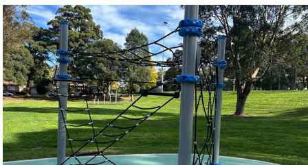
Homelands Reserve, Telopea