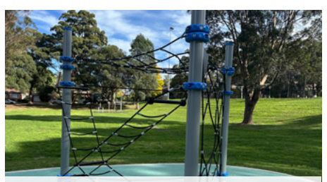
Homelands Reserve, Telopea