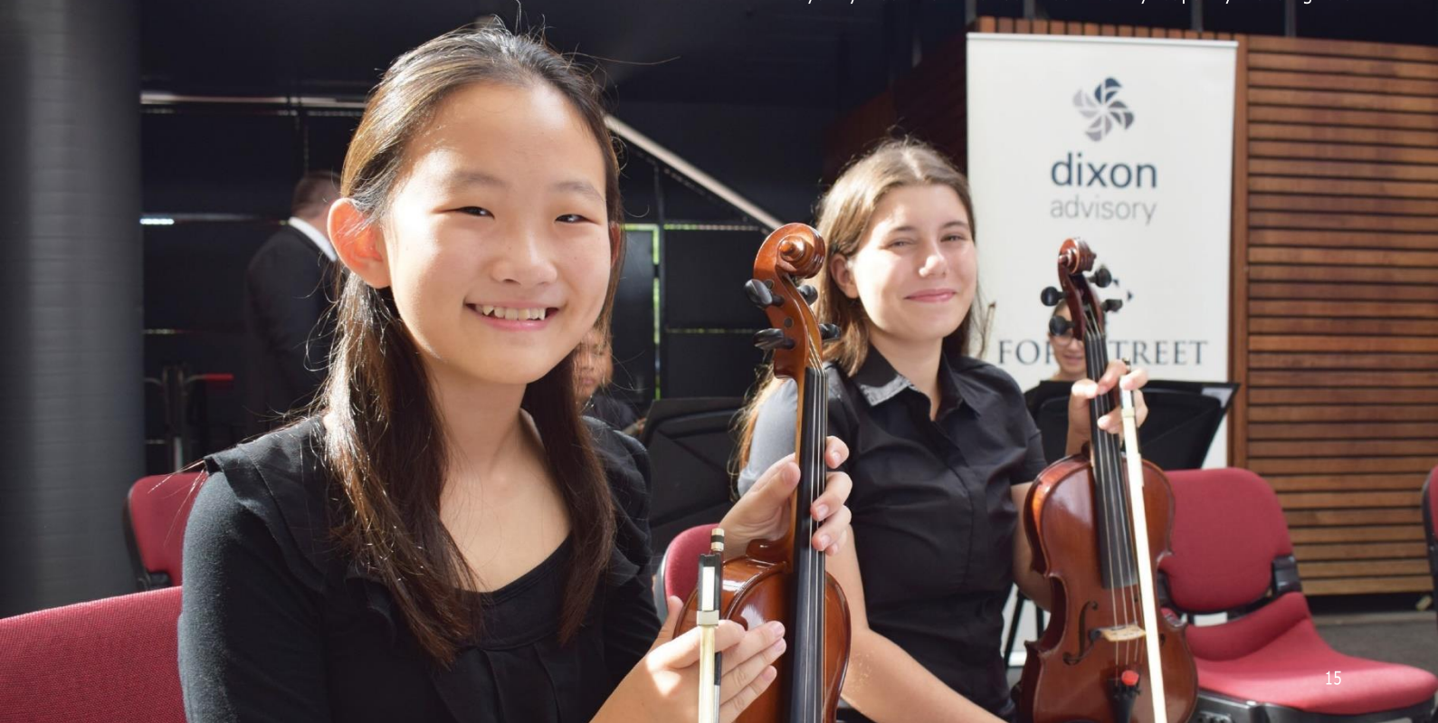
Sydney Youth Orchestras - Community Capacity Building Grant.