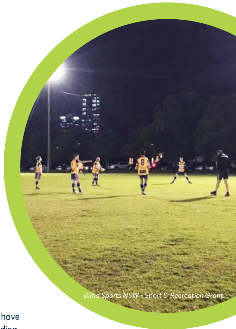
Blind Sports NSW - Sport & Recreation Grant.

If you need assistance in understanding these Guidelines, or have any questions, please contact the Community Capacity Building Team on 9806 5110 or email grants@cityofparramatta.nsw.gov.au .