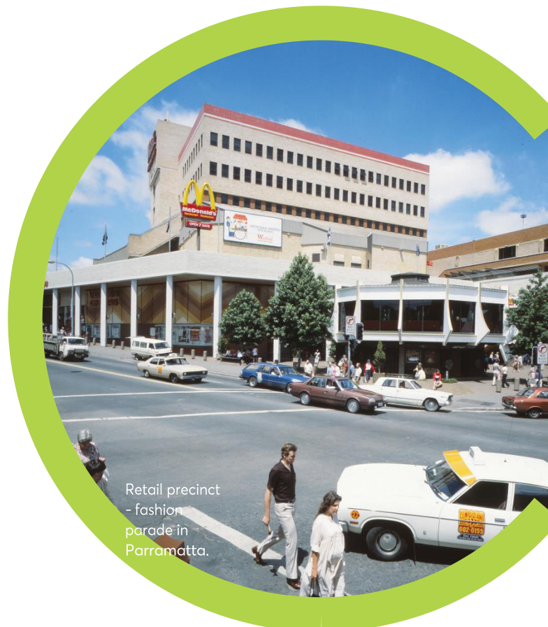
Retail precinct - fashion parade in Parramatta.

Failure to acquit the grant will affect any future funding requests.