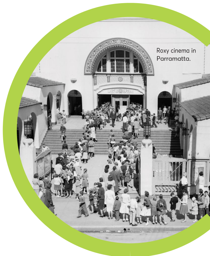
Roxy cinema in Parramatta.

For details about the advisory committee, please contact the Community Capacity Building Team on 9806 5110 .