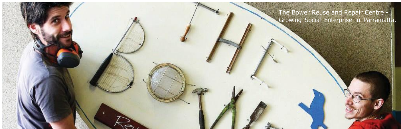
The Bower Reuse and Repair Centre - Growing Social Enterprise in Parramatta.