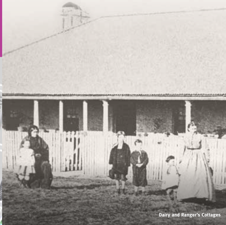
Dairy and Ranger's Cottages

Parramatta Park was extended and Governor Macquarie, who reigned from 1810 to 1820, commissioned extensive landscaping work. His vision of a 'picturesque parkland' still shapes the Park today.