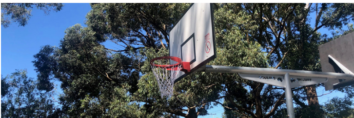
One of three new basketball rings at Loftus Square

Loftus Square is very popular with local kids as a place to come and play basketball. Council provided $800 in funding to replace three basketball rings. This park also provides many other activities and with its interesting bus shelter murals is a credit to the hard-working park committee.