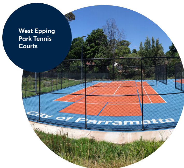
West Epping Park Tennis Courts