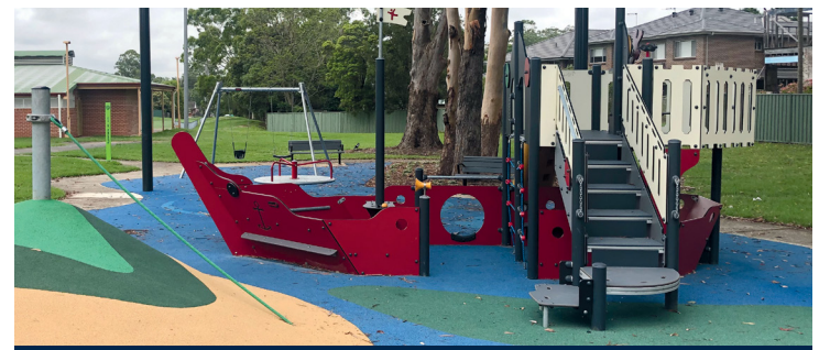
The new playground at Sir Thomas Mitchell Reserve