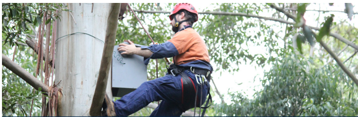
There are now 90 nesting boxes throughout the Epping Ward

DID YOU KNOW? Forest Park is home to a small community garden that is looked after by dedicated volunteers. It has an array of herbs to spice up your next meal – visit and take only what you need.