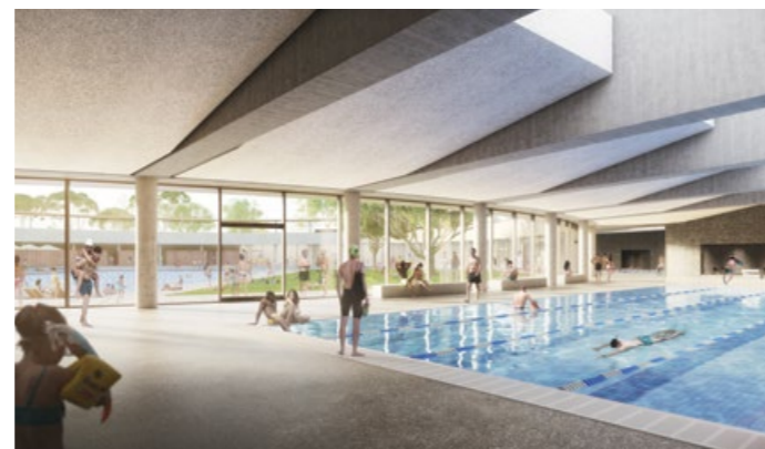
➔ Artist's impression of the 8-lane, 25-metre heated indoor pool

To find out more and sign up for email updates, visit: cityofparramatta.nsw.gov.au/poolupdate